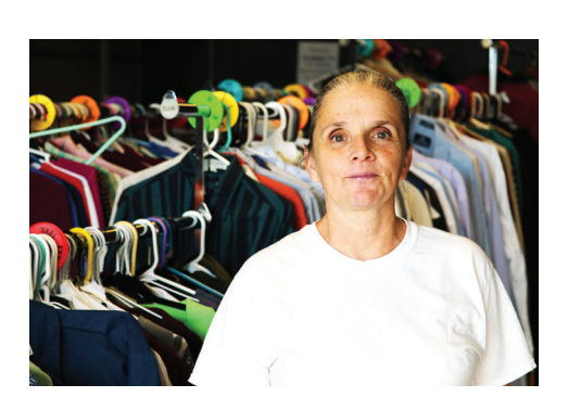
CENTRAL IOWA SHELTER & SERVICES Support Neighbors:

Develop innovative ways to meet our neighbors' basic needs of shelter and health.