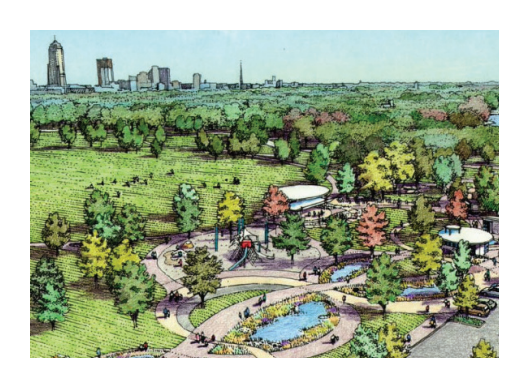
WATER WORKS PARK FOUNDATION Inspire Community Betterment: Ensure vibrant, accessible outdoor recreational experiences and sustainability efforts.

Grow strong, inclusive connections and build partnerships to create equity.