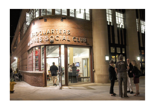
SOCIAL CLUB Enrich Arts & Culture:

Develop innovative ways to meet our neighbors' basic needs of shelter and health.